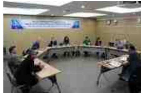
(The 3 rd Training Course of BR Managers, October, 2015)

http://wnicbr.jeju.go.kr/index.php/eng/news/notices?sso=ok